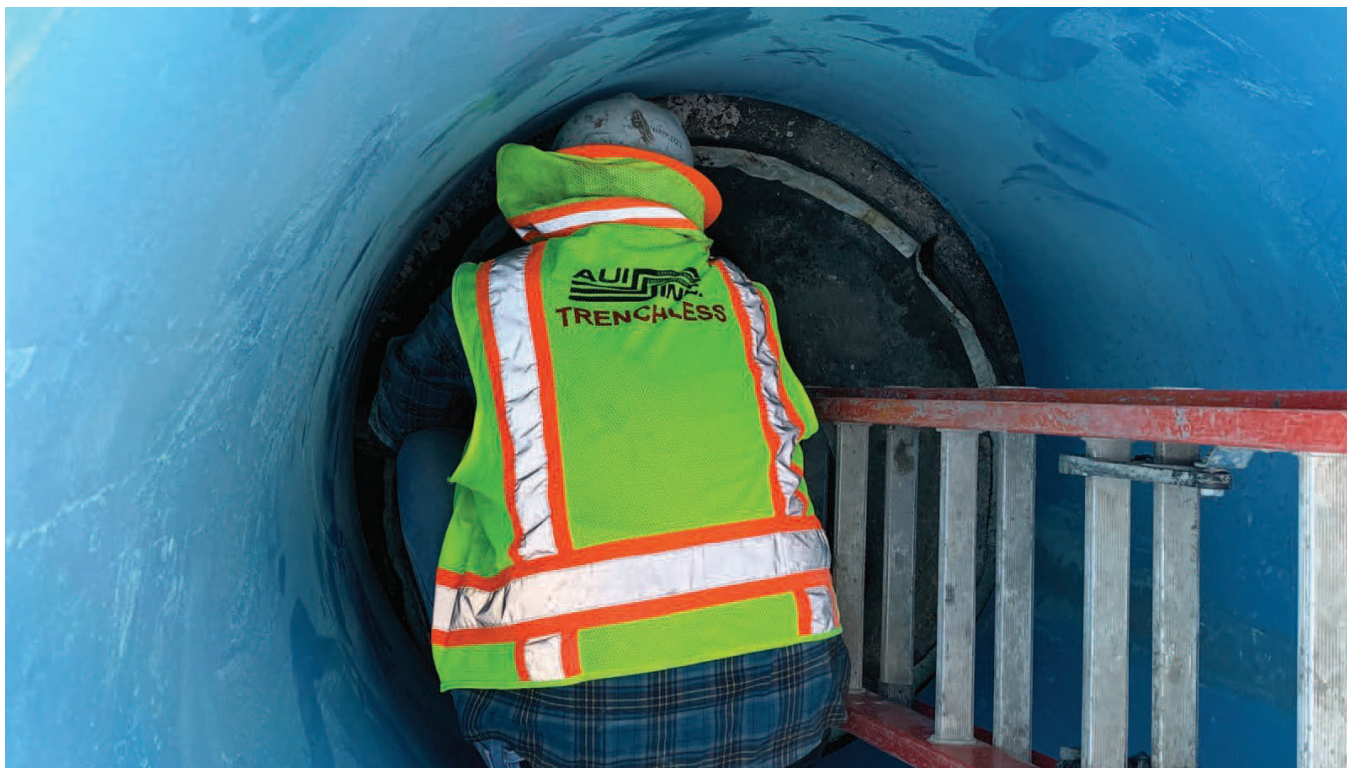
Setting the mastic on the bench to receive the PVC riser