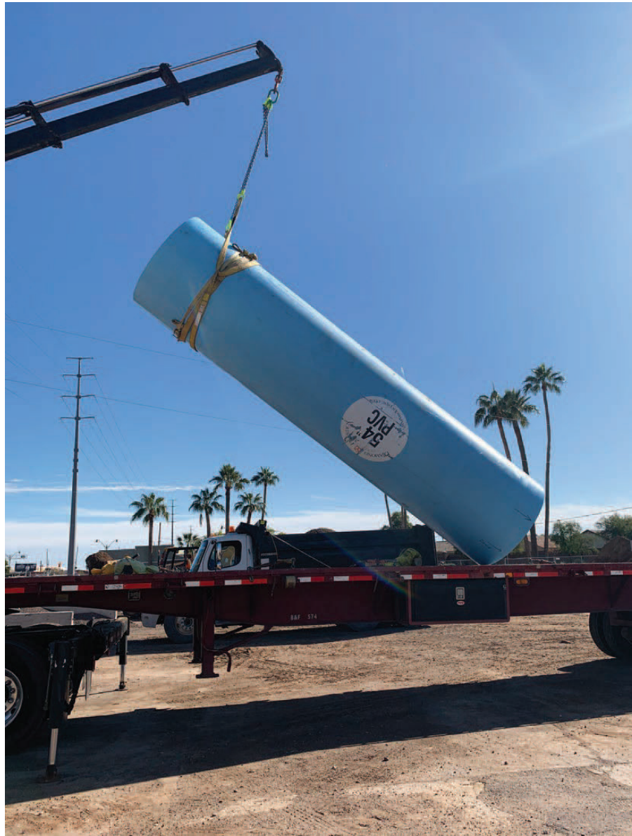
All components labeled