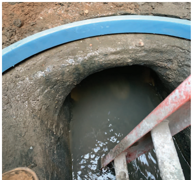
Assuring the riser fit the rebuilt bench