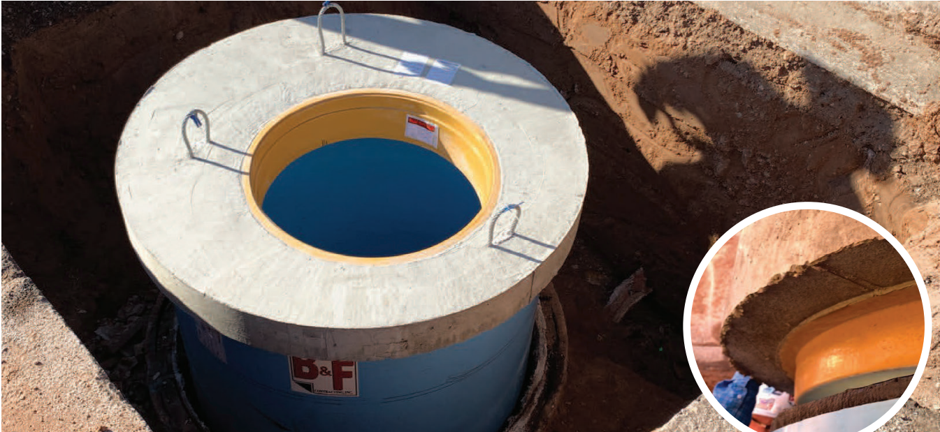
Corrosion-resistant riser and lid