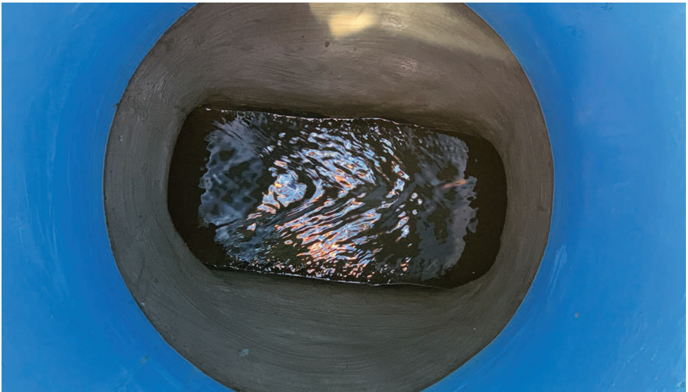
Bench to riser after trimming the mastic and cleaning the bench of construction debris