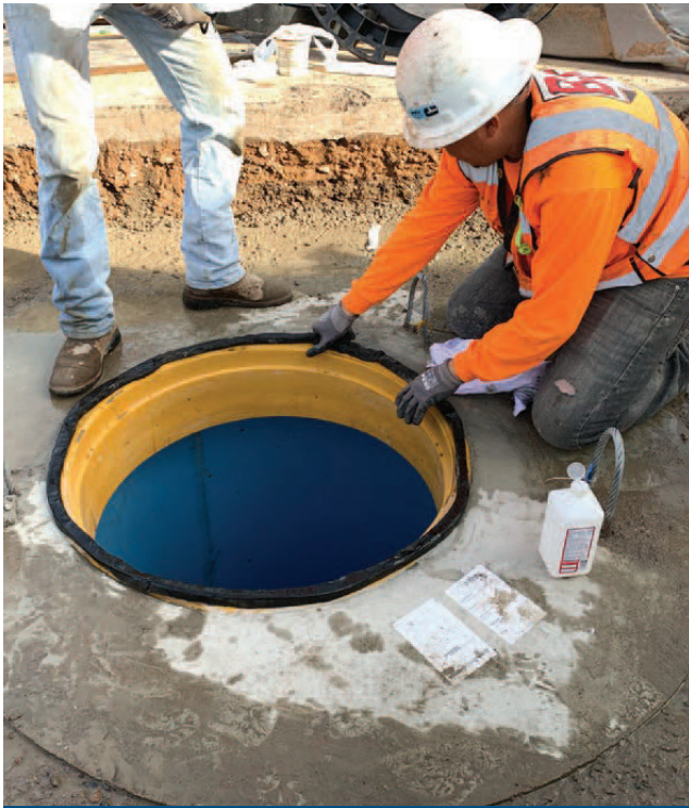
Field adjustment of height with grade rings