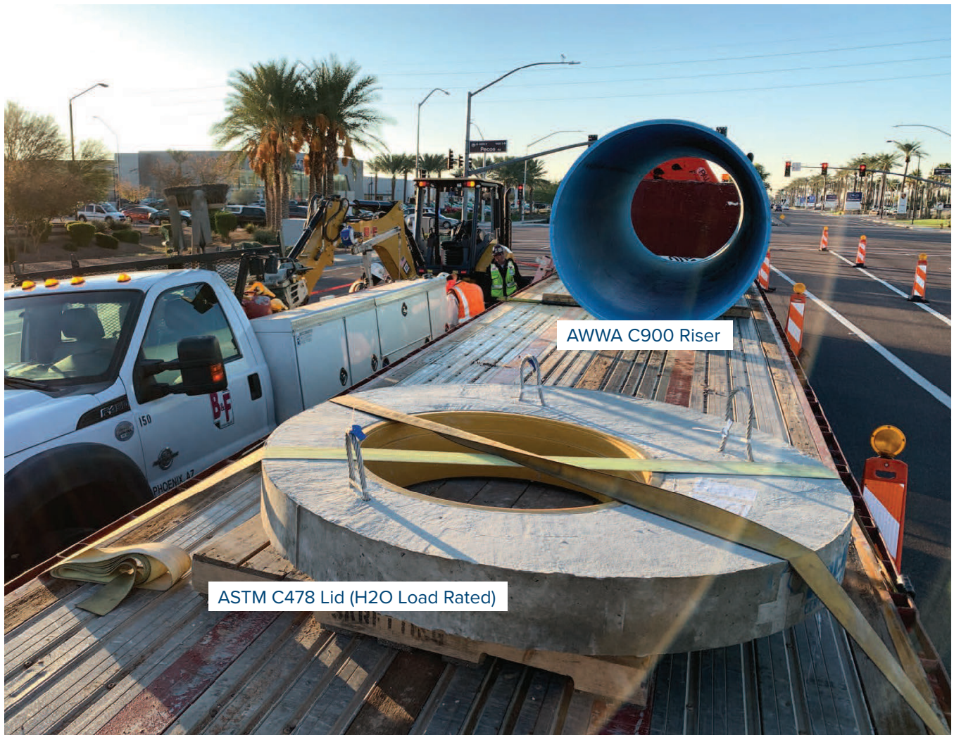
AWWA C900 Riser