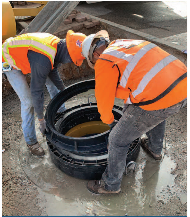
Install grade rings frame and cover