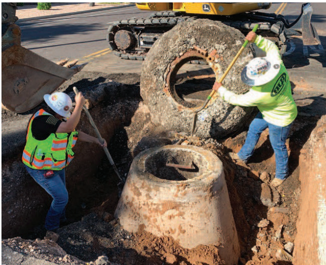
Removing cone from the structure