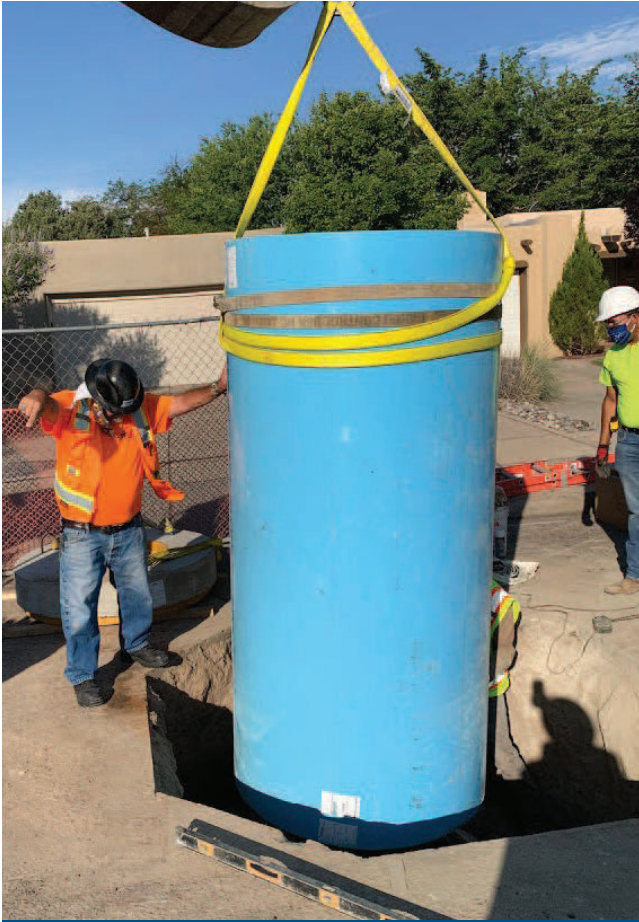
Lower AWWA C900 Riser onto base