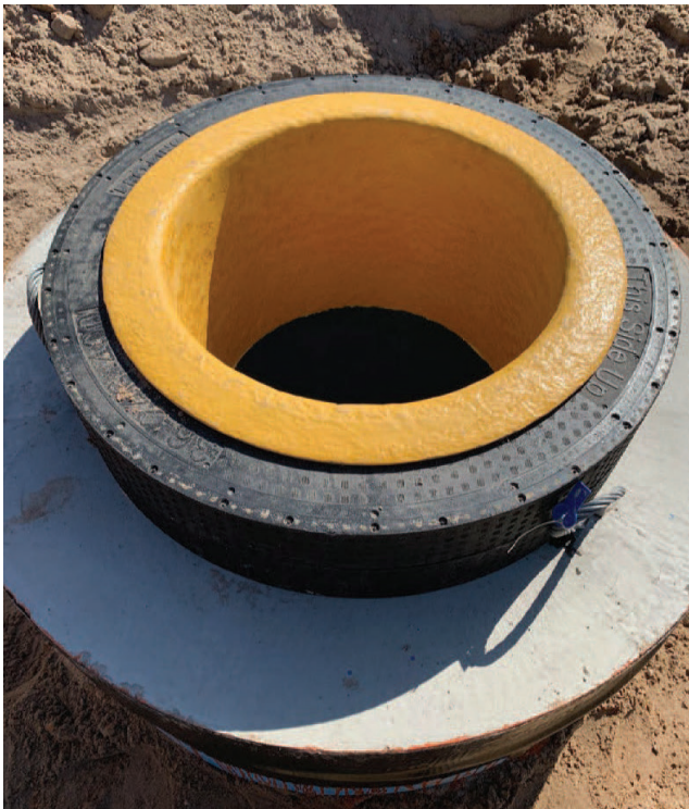
Telescopic access collar (optional)