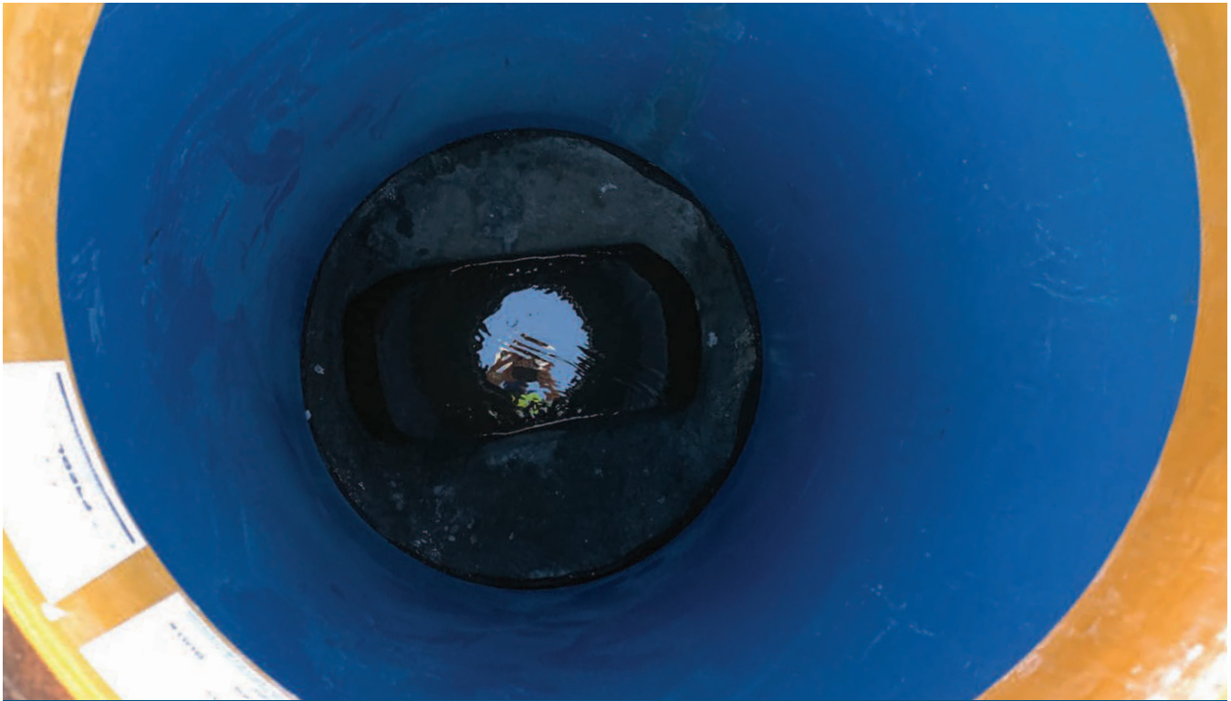
Mastic set all around