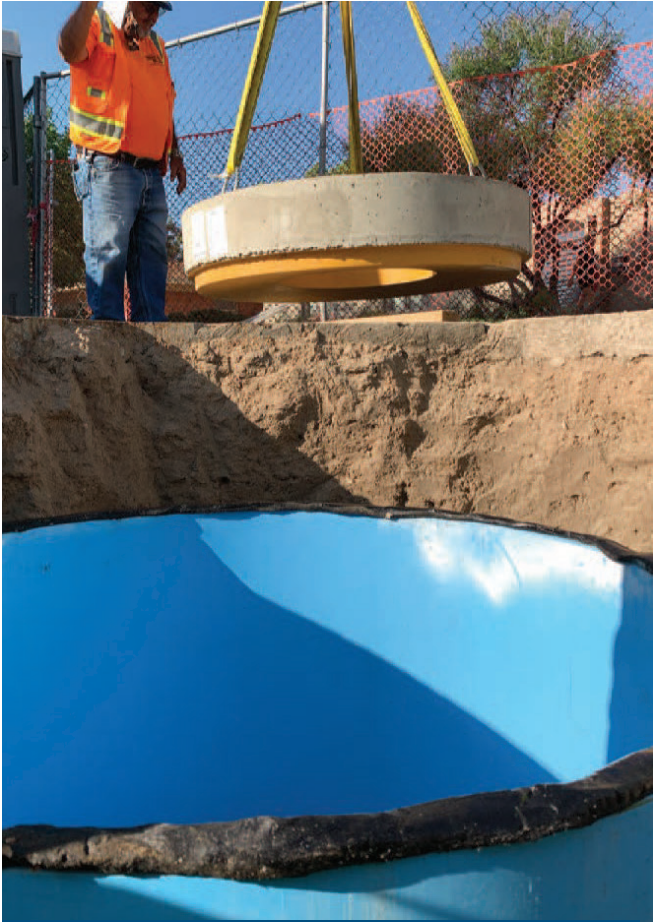
ASTM C478 Lid (H20 Load Rated)