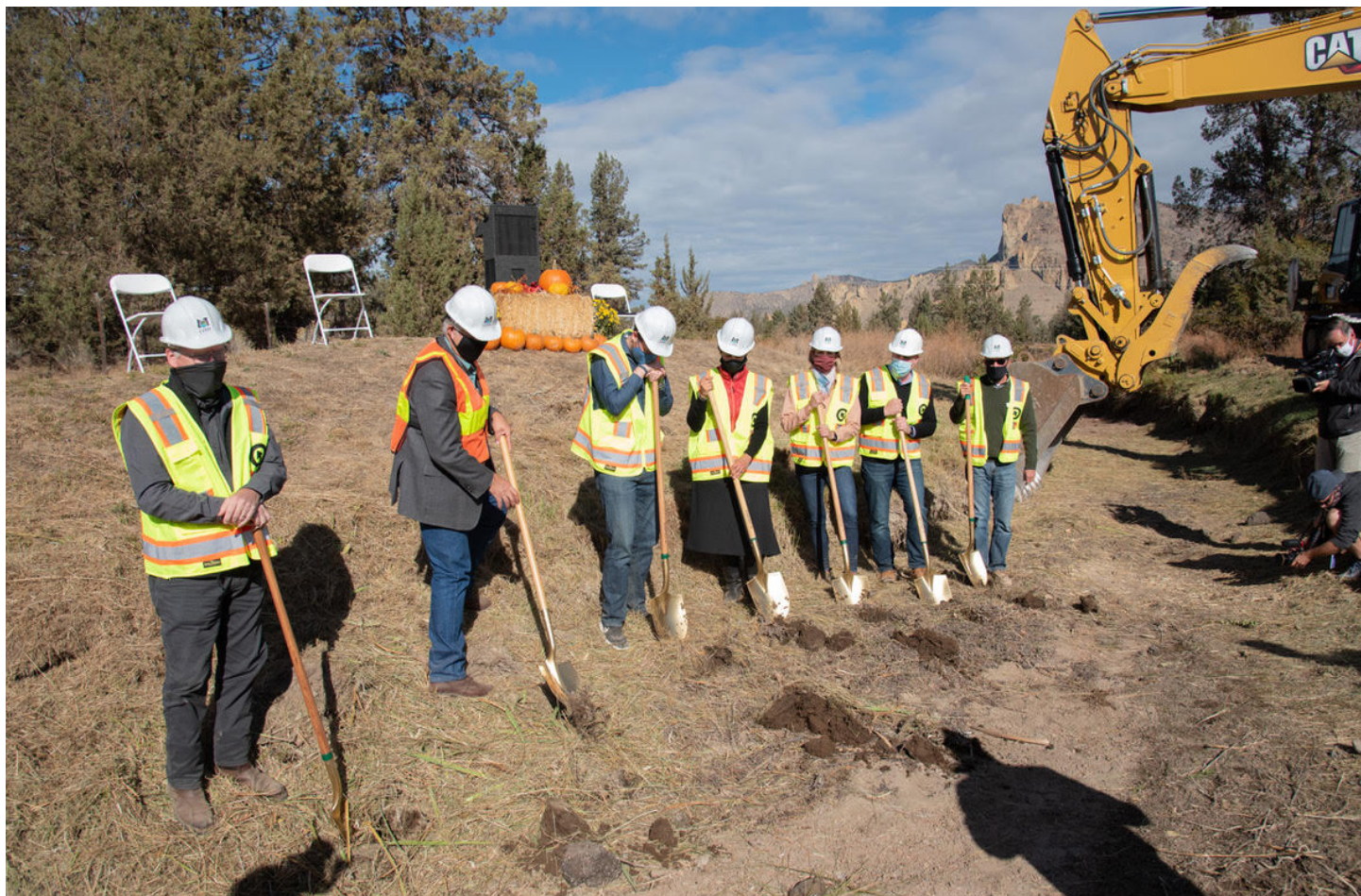
Groundbreaking on the Pilot Butte Canal piping project.

E stablished in 1918, Central Oregon Irrigation District (COID) is a municipal corporation of the State of Oregon. The district's mission is to provide a reliable supply of water to 3,500 patrons throughout Bend, Redmond, Powell Butte, and Alfalfa. COID operates and maintains over 400 miles of canals that collectively deliver water to approximately 46,222 acres of productive land.