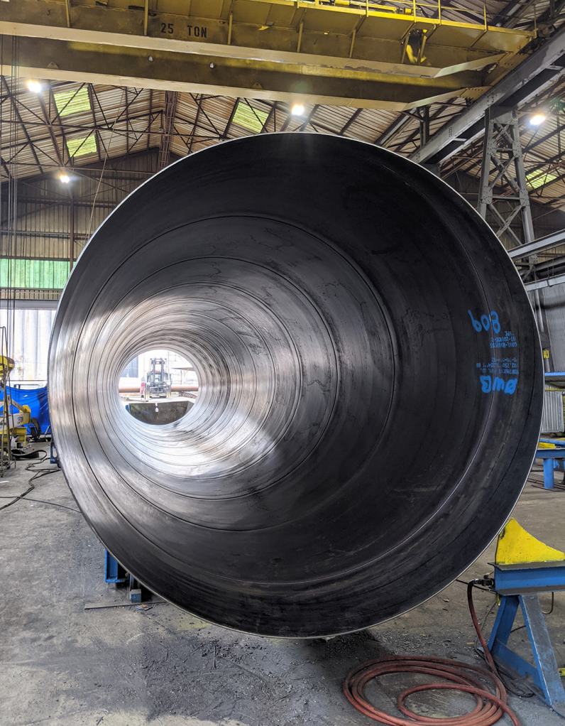
COID's raw pipe as it comes off the Northwest Pipe mill. The 102-inch spiralweld steel pipe is lined and coated with polyurethane before being transported to the worksite.

sustainable agriculture, save our patrons money, and help central Oregon better manage its water resources for the future. The amount of water COID saves through on-farm improvements, piping, and other conservation measures can be shared with North Unit Irrigation District (NUID) and other junior water right holders to ensure that farmers have the water they need, even in dry years. NUID will then be able to make water available from its storage in Wickiup Reservoir to increase winter flows in the Deschutes River.