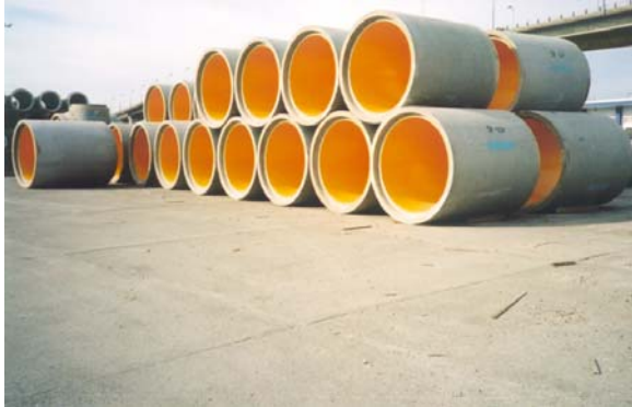
Picture: precast concrete pipes lined with AGRU-CPL

AGRU precast concrete pipes vs. FRP (fibre reinforced plastics) precast concrete pipes