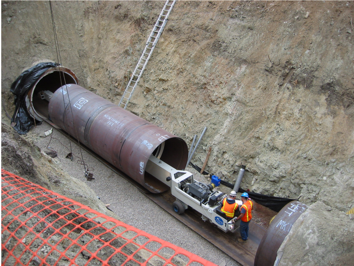
Figure 4. Pipe carrier a portal

The grouting operation began in mid January and proceeded throughout the process. Cement mortar lining operations followed the grouting operations and was the last stage of the relining process. The portals were then repaired with cement mortar lined and coated steel pipe.