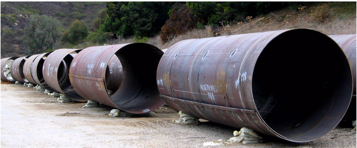
Figure 2. Stored cylinders at jobsite

All manufacturing processes and testing was performed under the inspection services of the San Diego County Water Authority.