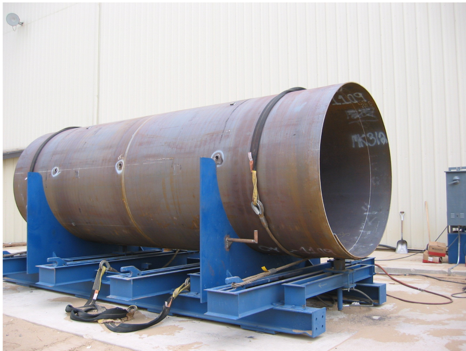
Figure 1. Collapsing Jig

Three material suppliers and six contractors combined to offer bids. The low bid was $20,870,000 the second low bid was $24,084,000 with the high bid submitted at $28,600,000. All of these bids came in under the Engineers estimate giving the owner good feed back that he was within budget forecasted for this complex project. The contract was awarded shortly after bid opening and immediately an excellent partnering relationship was established between the agency, contractor, and material supplier. Everyone recognized that this type of work had never been accomplished before and this project would be used as a learning tool to look for ways to improve efficiency, quality and scheduling for future projects.