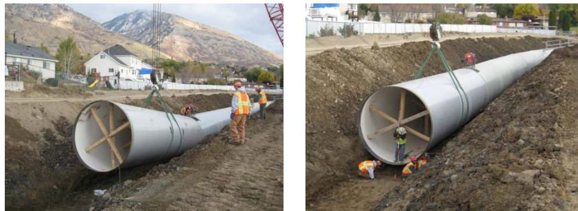
Figures 6 a, b: Pipe Hoisted and Placed into Trench, Grade Adjustment

Field Handling: Despite the tough nature of polyurethanes, prevention of damage to the coating system during pipe transportation and handling is emphasized in C222. The use of wide belt slings instead of chains, cables, or tongs is given emphasis, as is the importance of preventing metal tools or heavy objects from coming into direct contact with the finished coating. The dragging or skidding of coated pipe is also forbidden. Figure 6a shows pipe being hoisted using wide belt slings and placed into the trench on the PRCEP pipeline; figure 6b shows the pipe being adjusted to line and grade.