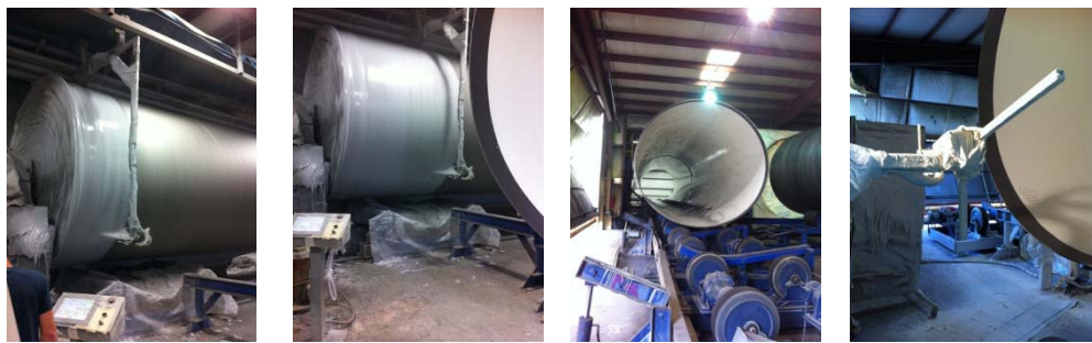
Figure 3a, b, c, d: Coating Application Progression, Pipe Rotation System for Lining, Lining Spray Lance

The section on Coating Application in C222 pays particular attention to temperature and environmental conditions during application, and calls for “fast-setting, short pot-life coating systems” to be applied by manual spraying, automatic spraying or by centrifugal applications, using appropriate plural component equipment. Two types of coating conveyor equipment systems are briefly described; in reality, the actual equipment usually varies from one applicator to another, so detailed guidance on this topic is not provided in the standard. On the PRCEP, a stationary but rotating pipe and a traveling spray gun were utilized for the external coating, Figure 3a and b. The internal lining was applied by keeping the pipe stationary, but rotating, figure 3c, and using a polyurethane spray lance, shown in Figure 3d that gradually extended longitudinally, along the entire inside length of the pipe, as the material was sprayed.