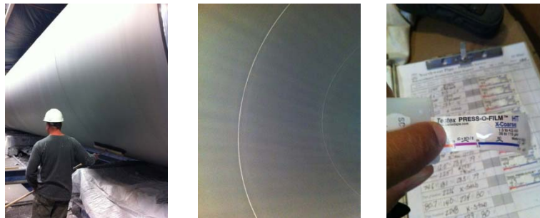
Figure 2a, b, c: Exterior, Interior Abrasive Blast Cleaning, Profiler Strip

For quality control, C222 requires that the temperature be measured and recorded to ensure it is above the dew point at the time of abrasive blast cleaning. After the blast cleaning, the surface of the pipe is cleaned, profile depths measured and recorded, and a visual comparison of the coloration of the blasted surface is made with the SSPC cleaning method specified. The standard also requires that flash rusting of the prepared surface be prevented. Figure 2a shows a completed exterior blast surface undergoing final cleaning, figure 2b shows a completed interior blast surface, and figure 2c shows coating profiler strips that are used to measure and record blast profile depths, per ASTM D4417 (2011).