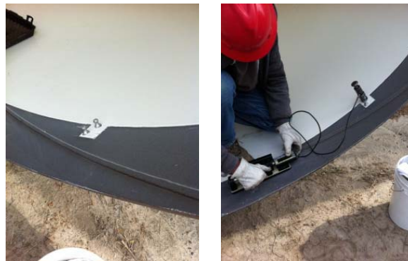
Figures 4a, b: Dollies Glued to Coating for Adhesion Test, Test Performance

Adhesion Testing: The adhesion testing of polyurethanes using ASTM D4541 has been the subject of further research in recent years due to the variability in testing results that may be obtained. Bambei et al. (2011) and McFatrige (2012) provide discussions on the variability. Croll et al. (2012) provide results of research conducted to study causes of the variabilities. For acceptance, the C222 standard requires that 2 pipes per shift be selected at random, one at the beginning of the shift, the other half-way through the shift, which are then tested for adhesion per ASTM D4541. Acceptable adhesion per C222 is 1,500 psi. If the adhesion values are unsatisfactory, then 2 additional tests are conducted at two different locations on the same pipe. The pipe coating on this pipe is rejected if either additional test fails. All pipes coated on that shift are then systematically inspected for acceptance or rejection. The PRCEP specification required that acceptable adhesion value be 1,750 psi minimum. Two types of pneumatic equipment were cited as acceptable adhesion testers: Defelsko Positest AT®, or Elcometer® HATE Model 108. Figure 4a shows dollies glued to coating surface for testing, and figure 4b shows test performance using Defelsko Positest AT® equipment.