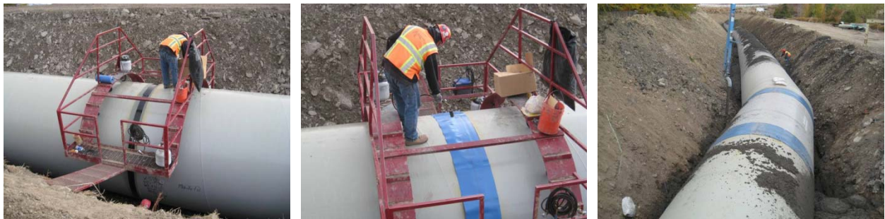
Figures 5 a, b, c: Heat-shrink Sleeve Application, per AWWA C216

For internal joint completion, C222 requires joint surface preparation to be the same as that used when shop-applying polyurethane on the pipe. Material application on a joint is also held to the same standard as shop-coated and lined pipe. Following joint completion, DFT, adhesion and holiday testing are applied to ensure quality control. The PRCEP specifications required that internal joint completion be performed by qualified applicators who had done at least 3 similar projects within the past 3 years, using the same coating system. The PRCEP also provided added guidelines on external joint completion using heat-shrink sleeves, per AWWA C216, and also to facilitate weld-after-backfill. Figure 5a shows heat-shrink sleeve application preparation, figure 5b shows heat being applied to a sleeve with a torch, and figure 5c shows pipe with completed joints being backfilled in the trench.