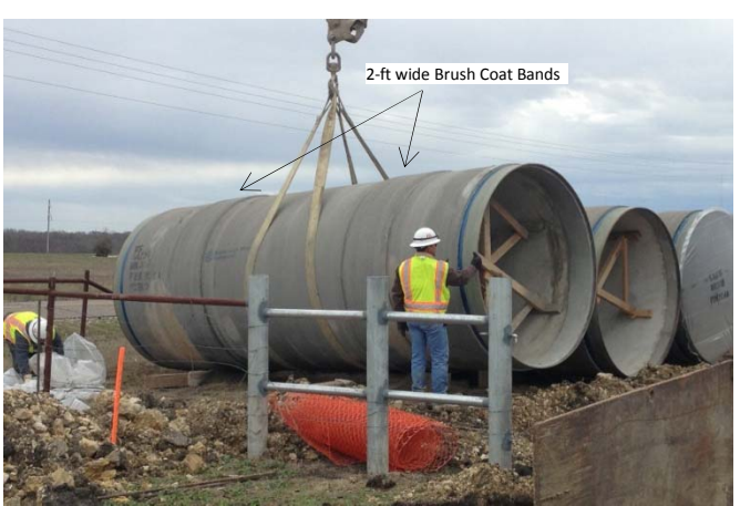
Figure 2: Steel Pipe for Cased Application, 20-ft Sections with Two Brush Bands per Section

Steel Water Pipe: The wall thickness for the 84-inch and 96-inch pipe was specified at a minimum of 0.365-inch and 0.417-inch, respectively, or a D/t ratio of 230, whichever was greater. In addition to direct buried pipe, there was also carrier pipe through casings. Buried pipe was specified at 50-ft lengths, while cased pipe had to be 20-ft in length. Lining for buried pipe was <sup>1</sup>/<sub>2</sub>-inch thick cement mortar lining per AWWA C205, and 35-mil thick polyurethane coating per AWWA C205, and polyurethane coating of 35-mil thickness per AWWA C222, with a 1-inch cement mortar overcoat, and two 1-inch thick by 2-ft wide brush coat bands per 20-ft section of pipe. Figure 2 shows steel pipe for cased application with brush coat bands.