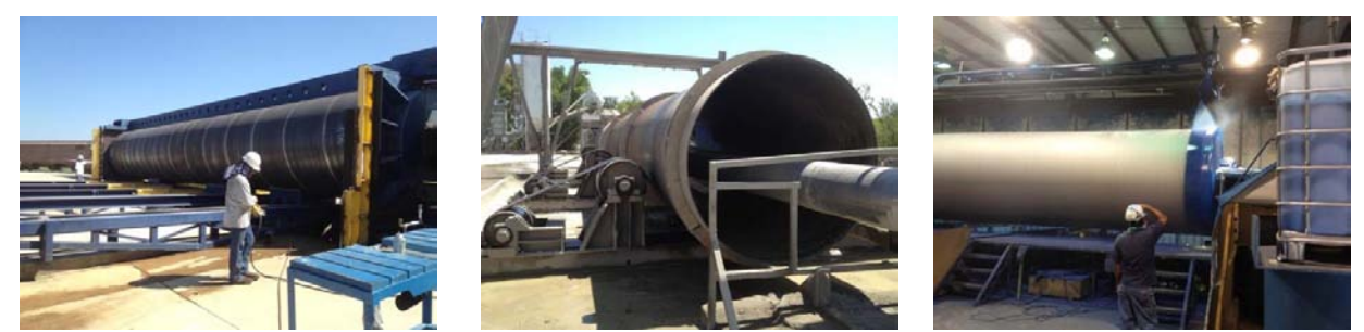
Figures 6a, b, c: Hydrostatic Testing, Cement Mortar Lining, Polyurethane Coating